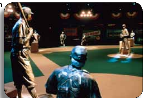
Negro Leagues Baseball Museum

Into the performing arts? The 2015 annual meetings will be held at the downtown Marriott, just steps away from the Music Hall Kansas City ( kansascity.broadway.com ). The Marriott is also located near the Kauffman Center for the Performing Arts (Kalmar Conducts Dvorak and Beethoven, March 27-29), the Sprint Center (Fleetwood Mac on March 28), and the Midland Theatre (Excision on March 29). Just a few miles south of the downtown Marriott, you'll find "Angels in America" playing at the Kansas City Repertory Theatre , and if you're willing to travel a bit farther from the conference facility, check out "The Merchant of Venice" at the Jewish Community Center or MOMIX at Johnson County Community College , both in Overland Park (KS). If you have a taste for choral music, the Heartland Men's Chorus will join with the nationally-renowned Lawrence Children's Choir to offer "Modern Families," a musical documentary that celebrates the changing face of American families, March 28-29 at the Folly Theater. Fans of jazz music should head to the Majestic , where there's live jazz every night, or check out the Phoenix Jazz Club in the Kansas City River Market .