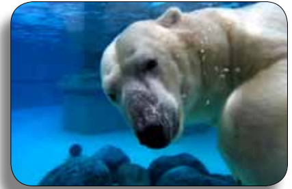
Nikita the polar bear, at the KC Zoo

For those traveling with children, an array of adventures awaits in Kansas City. Head down to Crown Center ( crowncenter.com ) and take in the SEA LIFE Aquarium and Legoland Discovery Center , then walk the Link to the iconic Union Station ( unionstation.org ) for Science City , the Xtreme Bugs exhibit, and the KC Rail Experience . The whole family can enjoy a show at the Arvin Gottlieb Planetarium or the Regnier Extreme Screen at Union Station or ice skate at the Crown Center Ice Terrace . Crown Center also offers Kaleidoscope , a multi-sensory creative center, and productions for children at the Coterie Theatre . Just five minutes southeast from the conference location, you'll find Stone Lion Puppet Theatre , and there's something for everyone at the Kansas City Zoo ( kansascityzoo.org ), which boasts beloved polar bears, Nikita and Berlin, as well as the new Helzberg Penguin Plaza . For little nature lovers, check out the Anita B. Gorman Discovery Center or take a trip south to the Deanna Rose Children's Farmstead in Overland Park (KS).