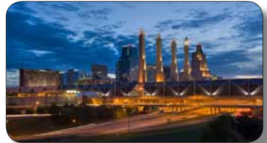
Kansas City Skyline

TOUR FEE: $18. Covers transportation and tour leadership. CAPACITY: 22