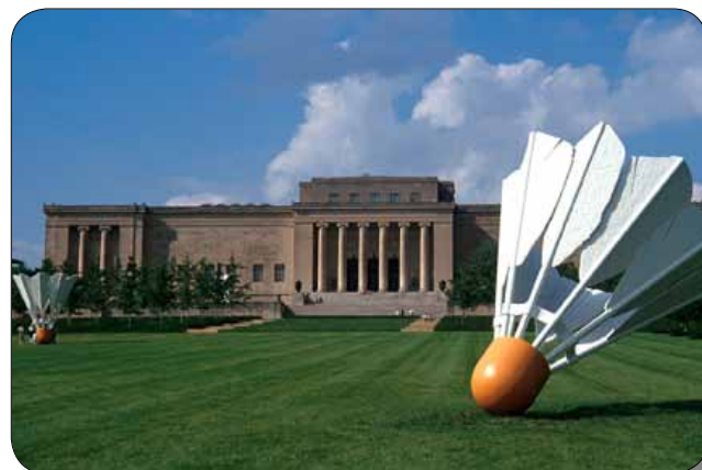
"Shuttlecock" at the Nelson-Atkins Museum of Art.

If you love art but prefer it a bit more stationary, you'll definitely want to make time for a visit to the Nelson-Atkins Museum of Art (nelson-atkins.org). Home of the iconic "Shuttlecocks" (1994) by Claes Oldenburg and Coosje van Bruggen, the museum showcases neoclassical architecture and an extensive collection of Asian art. The Bloch Building, added in 2007, ranked number one on "TIME" magazine's "The 10 Best (New and Upcoming) Architectural Marvels." Nestled in between the Nelson-Atkins and Mill Creek Park, the Kemper Museum of Contemporary Art was Kansas City's first cultural institution, established in 1885.