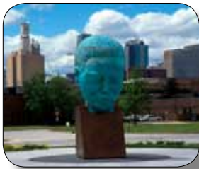
Charlie Parker Memorial in the 18th & Vine District