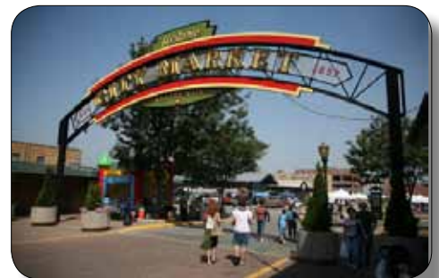
City Market is home to one of the largest farmers' markets in the Midwest.

TOUR FEE: $16 Covers transportation and tour leadership. CAPACITY: 23