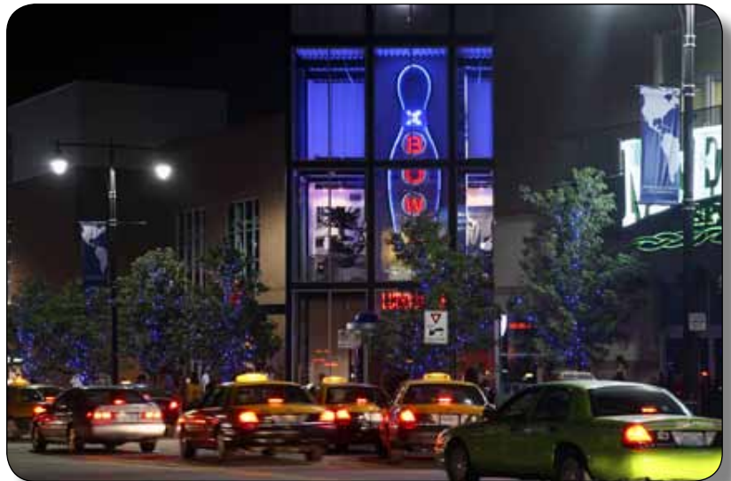
Kansas City's Revitalized Power & Light District

RENEW YOUR MEMBERSHIP by using the form inside this packet; or use a credit card to renew online on the membership page at the MSS website, www.TheMSS.org